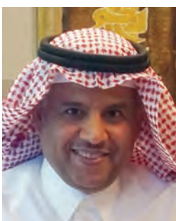
HE Saad Saleh I. Alsaleh, Amb of Saudi Arabia