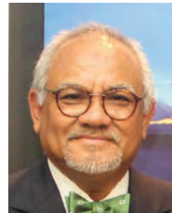
HE Dato' Zainol Rahim Bin Zainuddin, HC of Malaysia