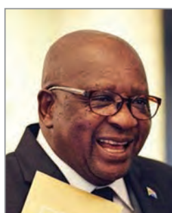
HE Modise Casalis Mokitlane, HC of South Africa