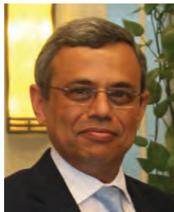
HE Jawed Ashraf, HC of India