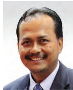
HE Ngurah Swajaya, Amb of Indonesia