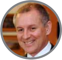
The Hon. Jay Weatherill MP The Premier of South Australia

The Hon. Jay Weatherill MP is South Australia's 45th Premier. He is a lawyer with an economics degree, establishing his own law firm in 1995 and practicing until he was elected as the Member for Cheltenham in 2002. He has held a range of portfolios including Environment and Conservation, Aboriginal Affairs and reconciliation, Minister Assisting the Premier in Cabinet Business and Public Sector Management, Families and Communities, Housing, Ageing, Disability, Urban Development and Planning, Administrative Services, Local Government and Gambling.