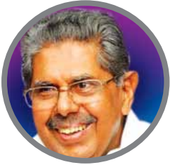
Mr Vayalar Ravi