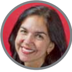
Senator Lisa Singh

Senator Lisa Singh was elected to the Australian Senate representing Tasmania in August 2010 and began her term on July 1st, 2011. She was earlier elected to the Tasmanian parliament as a Labor Member for Denison in 2006. In November 2008 Lisa became a Minister in the State Labor Government for Workplace Relations and Corrections and Consumer Protection. Prior to her election to the Tasmanian Parliament, Lisa served the community through working in the union movement, the non-government sector and the public service and has been actively involved in various community organisations, including the United Nations Association, Australian Republican Movement and as the former Director of the Tasmanian Working Women's Centre. As a member of the Tasmanian parliament Lisa served on various parliamentary committees. Lisa is the mother of two teenage boys and lives in Hobart. She is regarded as the first person of South Asian descent to be elected to the Australian Parliament. Lisa was Hobart citizen of year 2004.