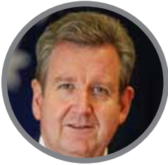
The Hon. Barry O'Farrell, MP Premier of NSW

I am pleased that NSW is hosting the Regional Pravasi Bharatiya Divas or Overseas Indians Conference in Sydney from 10-12 November 2013. The Conference reaches out to the Indian diaspora and will mark their significant contribution to India's development.