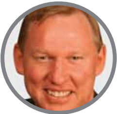
The Hon. Jeff Seeney, MP Deputy Premier of Queensland

The Hon. Jay Weatherill MP is South Australia's 45th Premier. He is a lawyer with an economics degree, establishing his own law firm in 1995 and practicing until he was elected as the Member for Cheltenham in 2002. He has held a range of portfolios including Environment and Conservation, Aboriginal Affairs and reconciliation, Minister Assisting the Premier in Cabinet Business and Public Sector Management, Families and Communities, Housing, Ageing, Disability, Urban Development and Planning, Administrative Services, Local Government and Gambling.