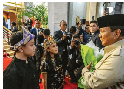
Indonesian Citizens and Students in Singapore Enthusiastically Welcome President Prabowo.

An exchange of visits between Leaders is very important in strengthening bilateral relations between two countries, as I said, it is the highest mechanism of bilateral relations. Interaction between Leaders,