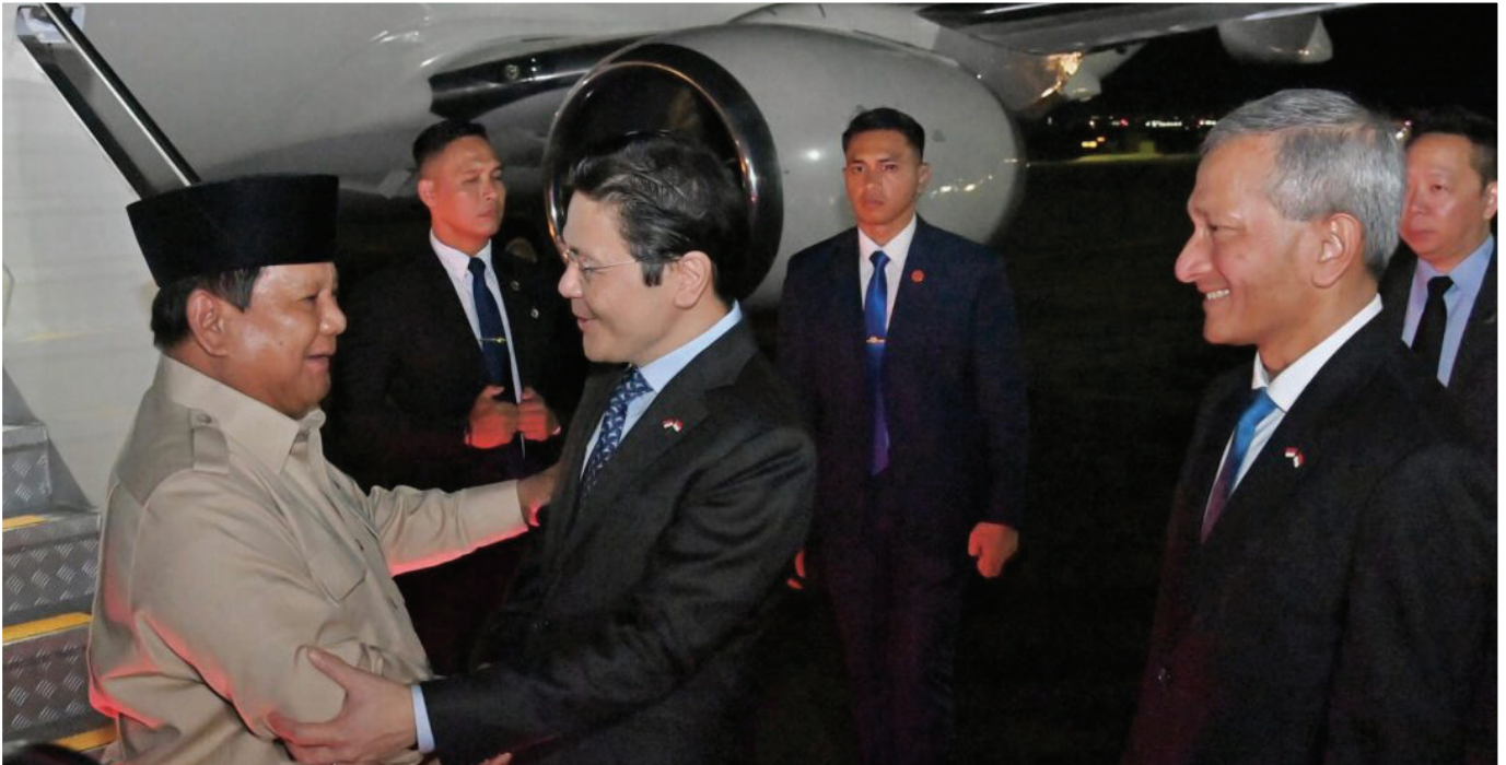
President of the Republic of Indonesia Prabowo Subianto arrived in Singapore on Sunday evening, 15 June 2025, (Day first, for a state visit.)