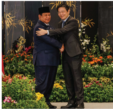
(Right Photo) The annual Leaders' Retreat meeting between the President of the Republic of Indonesia, Prabowo Subianto, and the Prime Minister of Singapore, Lawrence Wong.

During my almost five-year term as the Indonesian Ambassador to Singapore, this Leaders' Retreat is the best in terms of how Singapore showed its respect and friendship to Indonesia.