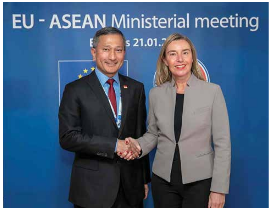
Singapore Foreign Minister Dr Vivian Balakrishnan and Federica Mogherini, High Representative for Foreign Affairs and Security Policy.

he 22nd EU-ASEAN ministerial meeting was held in Brussels on 21 January and brought together foreign ministers of the European Union and their counterparts from the 10 member states of the Association of Southeast Asian Nations (ASEAN). Minister for Foreign Affairs Dr Vivian Balakrishnan attended and co-chaired this event. They reaffirmed the significant role played by ASEAN and the European Union in shaping the political, socio-economic, and security agenda for both regions and globally,