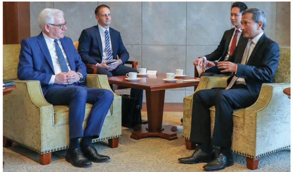
Polish Foreign Minister Jacek Czaputowicz (seated in front left) met his counterpart Dr Vivian Balakrishnan and discussed the friendly and growing bilateral ties

Minister of Foreign Affairs of the Republic of Poland, HE Jacek Czaputowicz, made an introductory visit to Singapore, in conjunction with the 50th anniversary of the establishment of diplomatic ties between Poland and Singapore between 24th to 27th April 2019.