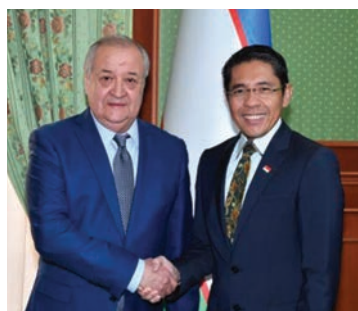
Dr Maliki with Uzbek's Foreign Minister Abdulaziz Kamilov

SMS Maliki also met with Minister of Foreign Affairs Abdulaziz Kamilov and Minister of Preschool Education Agripina Shin. During SMS Maliki's call on Minister Kamilov, both sides reviewed the bilateral relationship and reaffirmed the warm and friendly relations between Singapore and Uzbekistan. They also exchanged views on regional developments and security issues. SMS Maliki and Minister Shin welcomed the growing interest from Singapore's private sector in Uzbekistan's pre-school education sector, and discussed their respective policies in this field.