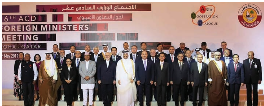
Heads of delegation at the 16th ACD

While in Doha, SMS Maliki also met with senior Qatari office holders and officials who included Deputy Prime Minister and Minister of State for Defence Affairs Dr Khalid Bin Mohammed Al Attiyah, Minister of Commerce and Industry Ali Bin Ahmed Al Kuwari, and Minister of Justice Dr Issa Bin Saad Al Jafali Al Nuaimi.