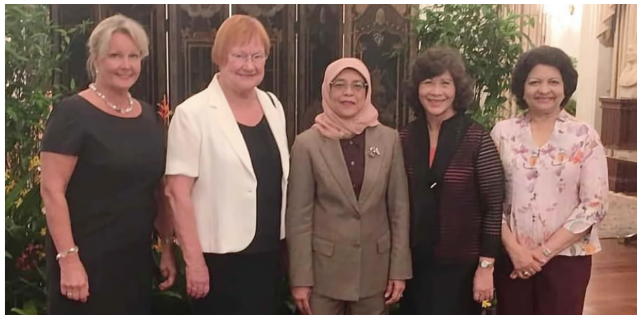
Engaging with a wide cross section of Singapore society including (above) meeting with the President of Singapore Halimah Yacob as well as (middle column) civic and professional groups and organisations and students from Singapore Chinese Girls School