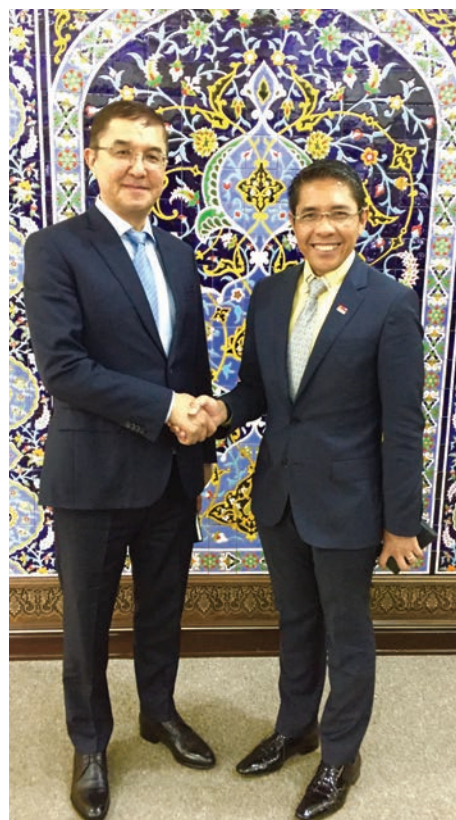
Warm greeting by Uzbekistan's Deputy Prime Minister and Minister of Finance HE Jamshid Kuchkarov for Dr Maliki

A Singapore Ministry of Foreign Affairs release on SMS Dr Maliki's wide ranging visit acknowledges the growing scope for cooperation in sectors such as tourism, business and education