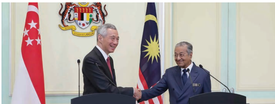
The prime ministers at a joint press conference on the 9th Leaders' Retreat

A Joint Statement was issued by Prime Minister Tun Dr Mahathir Mohamad and Prime Minister Lee Hsien Loong following the 9th Leaders' Retreat in Putrajaya on 9th April 2019. At a joint press conference on the Retreat, Prime Minister Lee said, "Our relationship is rooted in our long history, and strong family and business ties. This has remained unchanged even with the new Malaysian government. We have worked hard to strengthen these ties and to overcome issues which have risen, for example, when Malaysia informed us of their wish to review the KL-Singapore High Speed Rail, we worked out a suspension arrangement together."