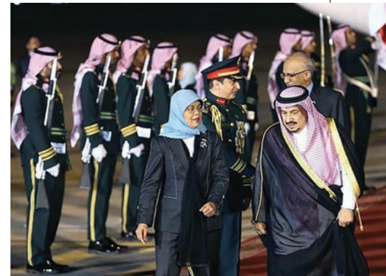
On arrival: President Halimah with HRH Prince Faisal Governor of Riyadh

The President also met the Singapore community in Saudi Arabia at a reception where she said: "With Saudi Arabia being one of Singapore's largest economic partners in the Middle East, many Saudi giants, such as Saudi Aramco and SABIC have a presence in Singapore. With this State Visit, I hope Singapore can do even more with Saudi Arabia and the two countries can take bilateral relations to a new level. Yesterday, we signed an MOU on environmental protection and water resources management. This is another good catalyst for deeper cooperation, and will provide more opportunities for the peoples of both countries."