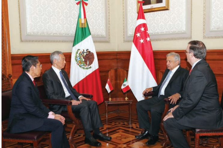
Meeting between Prime Minister Lee Hsien Loong and President of the United Mexican States Andrés Manuel López Obrador

to further enhance trade and productive investment for both countries, and supported the intention of concluding the process this year. They also underscored the importance of the Comprehensive and Progressive Agreement for Trans-Pacific Partnership (CPTPP), a high-standard agreement already in force between Singapore and Mexico. President López Obrador also welcomed Singapore's investments in Mexico, that totalled over