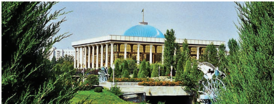
The Oliy Majlis (Parliament of Uzbekistan) in capital Tashkent

President Mirziyoyev has taken steps for governance reforms and the upcoming parliamentary elections is an important part of this reform process