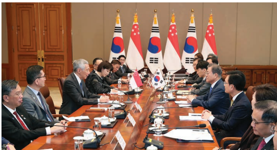
Delegation Meeting between Prime Minister Lee Hsien Loong and President of the Republic of Korea Moon Jae-in.

Prime Minister Lee Hsien Loong, accompanied by Mrs Lee, visited South Korea from 22nd to 24th November 2019 at the invitation of the President of the Republic of Korea (ROK) Moon Jae-in. The visit was in conjunction with the ASEAN-ROK Commemorative Summit in Busan from 25th to 26th November 2019.