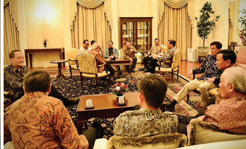
(Above from left): Warm welcome to Singapore by Indonesia's Ambassador Suryo Pratomo. Both the Indonesian ministerial delegation and Singapore ministers get a chance to meet up first at the East Drawing Room of the Istana