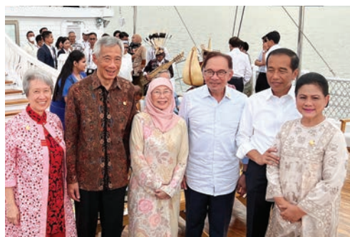
On the side-lines of the 42nd ASEAN Summit Prime Minister Lee Hsien Loong and his wife Ho Ching joined other leaders embarking on a sunset view Pinisi boat ride

Underpinning Singapore's appreciation of efforts to review the grouping's capacity and institutional effectiveness PM Lee said: "We should streamline and optimise ASEAN processes, and strengthen the ASEAN Secretariat and the role of the ASEAN secretary-general to enable them to more effectively implement our key priorities."