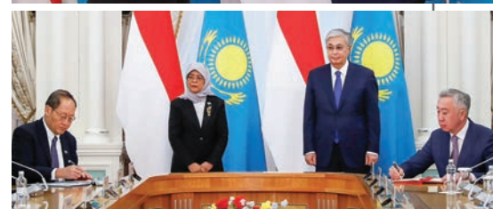
The President witnessed the signing of several agreements and MOUs, including the Agreement of Trade in Services and Investment under the framework of the Eurasian Economic Union-Singapore Free Trade Agreement which will further strengthen economic ties.