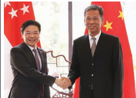
(From left): DPM Wong with China's Minister of Finance, Liu Kun

The Beijing visit marks another brick in the wall to cement Singapore-China ties