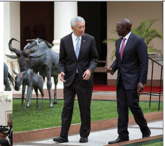
PM Lee in discussion with Kenya's President William Samoei Ruto at the State House (above) and (left) in delegation discussing amongst other matters economic cooperation. Bilateral trade in 2021 increased by almost 25% year-on-year despite COVID-19, making Kenya one of Singapore's important trading partners in Sub-Saharan Africa. (Below): three MOUs were signed focusing on ICT, climate change, and human capital development

Prime Minister Lee Hsien Loong's official visit to Kenya from 17th to 19th May 2023 cements bilateral relations, fosters collaboration in the green economy, digitalization, and climate change, unlocking new avenues for mutual progress and development