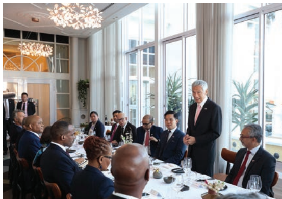
(Above left): PM Lee and President Ramaphosa witnessed signing of two bilateral cooperation MoUs on Skills Development and ICT. (Above right): Working lunch with business leaders from South Africa. (Below): Meeting dynamic overseas Singaporean community from South Africa and further afield