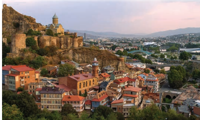
Panorama of Tbilisi, capital city of Georgia

Along with its accessibility its extensive economic reforms, down-sized tax burdens and long-term investment, have transformed Georgia into an emerging powerhouse of stability for doing business