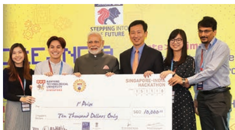
Past winners of the third edition of the Hackathon

The finals of the Singapore-India Hackathon 2023, which will be held at IIT Gandhinagar in Gujarat, India bringing together the best of both countries' startups to showcase their innovative solutions and gain exposure to global policymakers, investors, and potential customers. With a focus on Fintech, Sustainability, and ESG, the event brings together two of the most dynamic ecosystems in the world - India's $60 billion plus Fintech Market and Singapore, one of the top-tier global Fintech hubs. Additionally, the event provides a platform for startups to align their solutions with the UN Sustainable Development Goals. It is organised by the Nanyang Technological University, Singapore, and the Indian Ministry of Education All India Council for Technical Education in partnership with the Monetary Authority of Singapore, Confederation of Indian Industries, Enterprise Singapore, SGInnovate, Singapore Fintech Festival, Start Up India, and IIT Gandhinagar. The Hackathon fosters bilateral cooperation between students and startups from Singapore and India. The finals will be held as part of India's G20 Presidency in Gandhinagar, Gujarat, under the G20 Finance Ministers' meeting and the event will witness the participation of policymakers from over 20 countries, representing 85% of the world's GDP.