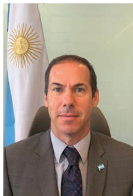
H.E. Mauricio Nine, Ambassador of Argentina to Singapore

Possessed of enormous natural resources and a deep pool of human talent Argentina seeks to engage investors to spur fresh impetus to local productive capacities, value chains and employment opportunities