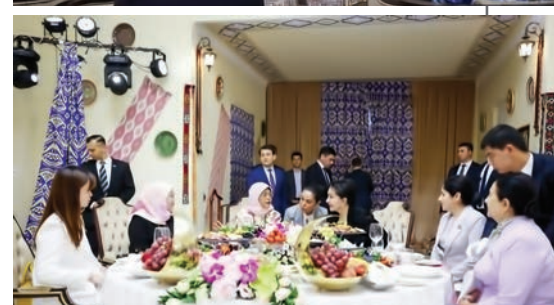
(Clockwise from above left): President Halimah met with industry leaders at the Singapore-Uzbekistan Business Forum where she encouraged them to consider the opportunities in Uzbekistan. Religious leaders representing different faith-based groups and attended a dinner hosted by Chairperson of the Senate of the Oliy Majlis Tanzila Narbayeva which turned out to be an insightful conversation with the female parliamentarians said the President

with students and faculty. She spoke about the importance of good governance and the role of women in public life. She was hosted to dinner by H.E. Tanzila Narbaeva, Chairperson of the Senate of the Oliy Majlis, and meet several female Uzbek parliamentarians.